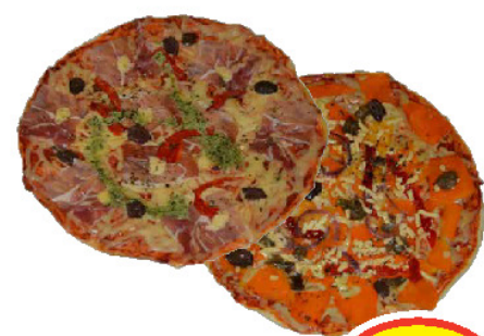
NGF Pizza's 375g, 400g, 500g Single sell: $5.99ea