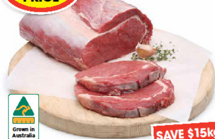
Australian Scotch Fillet Portions (average piece size 2kg)