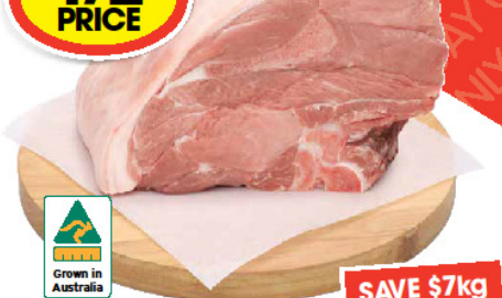
Australian Pork Shoulder Bone In