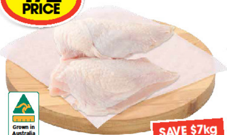
Australian Chicken Breast Fillets Skin On (minimum pack size 1.25kg)