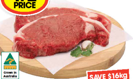
Australian Rump Steak (minimum pack size 1.25kg)