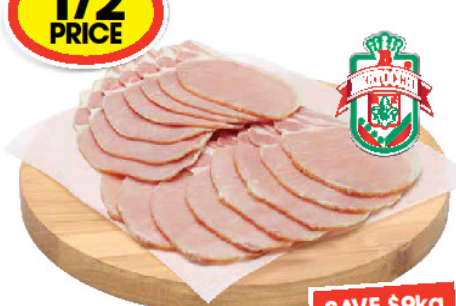
Bertocchi Short Cut Bacon